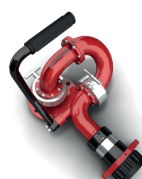
STATIONARY FIRE MONITORS

URALMEHANIKA IS ONE OF THE LARGEST AND MOST MODERN MANUFACTURERS OF FIRE-FIGHTING EQUIPMENT IN RUSSIA. IT MANUFACTURES ENTIRE RANGE OF HIGH-PRESSURE FIRE-FIGHTING MONITORS (VARIETY OF PORTABLE AND STATIONARY MONITORS WITH MANUAL CONTROL, ELECTRIC STATIONARY MONITORS WITH REMOTE CONTROL, PROTECTED ELECTRIC MONITORS WITH REMOTE CONTROL), FIRE WATCH TOWERS EQUIPPED WITH MONITORS, TOWED FIRE-FIGHTING TRAILERS EQUIPPED WITH MONITORS AND FIRE-FIGHTING ROBOTS. OUR FIRE-FIGHTING EQUIPMENT IS BEING USED IN FOLLOWING FIELDS: CONSTRUCTION, OIL AND GAS, PETROCHEMICAL PLANTS, SHIPYARDS, AND MANUFACTURERS OF FIRE FIGHTING VEHICLES AND SPECIAL EQUIPMENT.