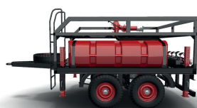
TRAILED FIRE FIGHTING EQUIPMENT