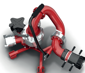
PORTABLE FIRE MONITORS